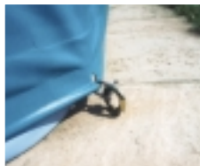
Cable Anchor system (requires solid fixing points)