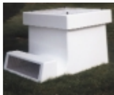
Inflation fan (in weather proof housing)